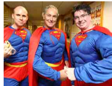
Squash players dressed for the occasion at the Wing Ding tournament, which raised HK$1.1 million for charity.