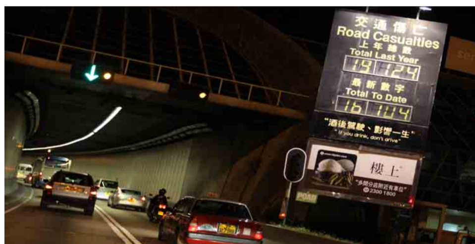
Road casualty totals are displayed on an electronic board at Aberdeen Tunnel and (right) a taxi that mounted the pavement in Shanghai Street, Mong Kok, yesterday.