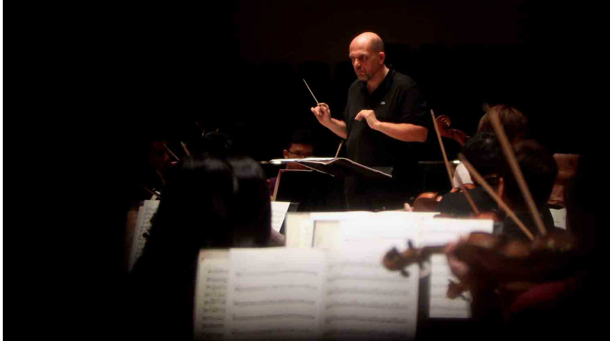
Jaap van Zweden, music director of the Dallas Symphony Orchestra in the United States, leads members of the Hong Kong Philharmonic during an intense rehearsal.

Jaap van Zweden , newly crowned US Conductor of the Year, is in spotlight as he auditions for Hong Kong Philharmonic's top spot with concert series this month